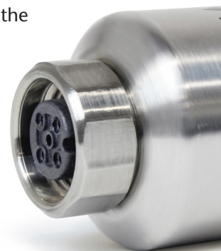
Closeup of the M12 Connector