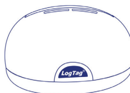
LTI HID Not Included