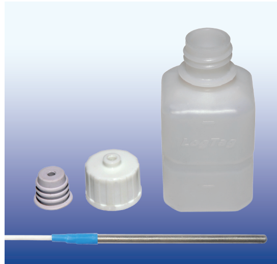
Glycol buffer (seal, cap and vial) with ST100K sensor

The glycol buffer contains three parts: the vial, the seal and the cap. To use the buffer with one of the sensors, please fill and seal the vial according to these instructions: