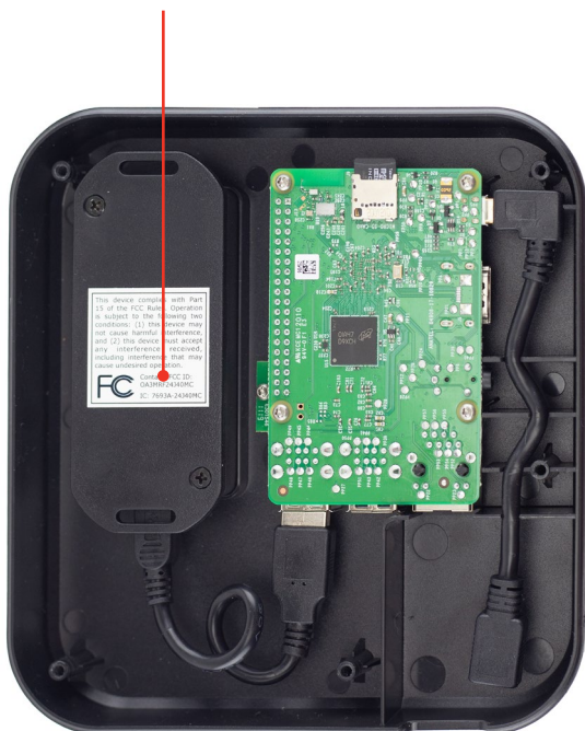
1a. Wireless Transceiver