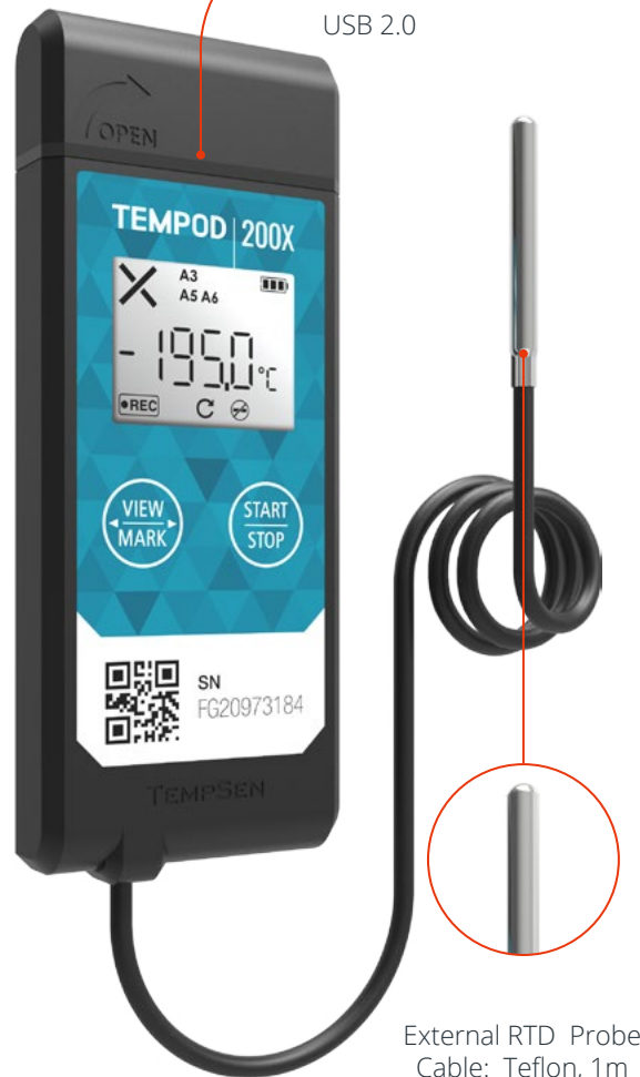
External RTD Probe Cable: Teflon, 1m