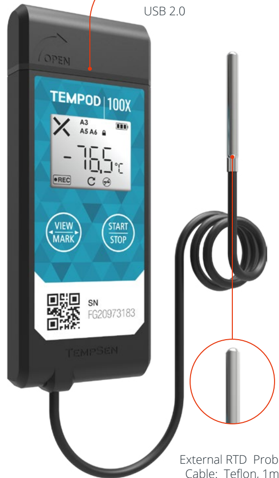
External RTD Probe Cable: Teflon, 1m