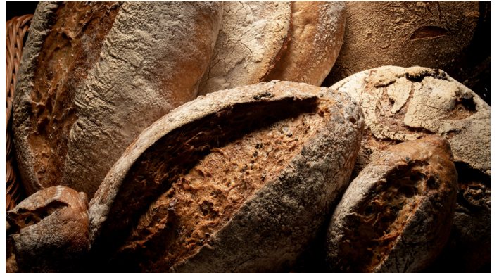
Food & Produce