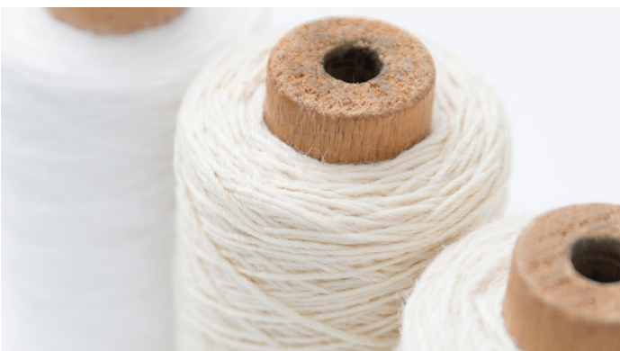
Textiles & Wood