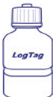
Glycol Buffer Not Included