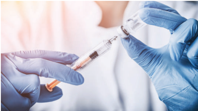
Vaccines / Medical & Healthcare