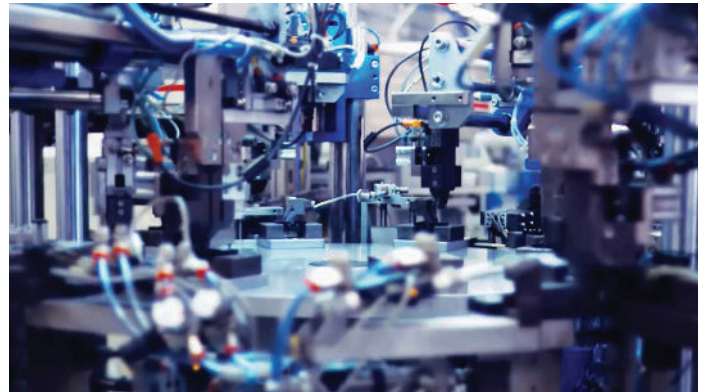
Industrial & Manufacturing