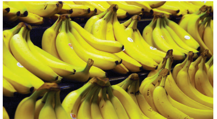
Food & Produce