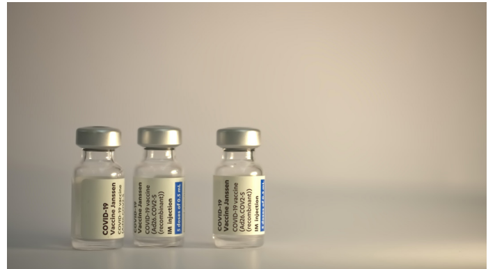
Pharmaceutical and Vaccine