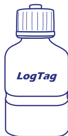
Glycol Buffer Not Included - Optional