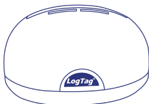
LTI-HID Interface Not Included - Optional